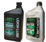
15.5823 Udor Lube Premium Pump Oil