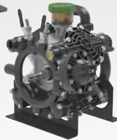
OMEGA 195 TS2C

OMEGA 195 pumps are excellent choices for various horticultural and agricultural spraying applications.