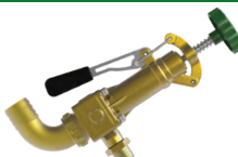
6005.08 Control Unit Regulator