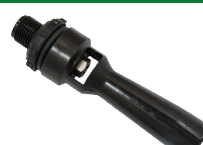
0016.04 Venturi Agitator 1/2" MNPT Inlet