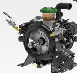
OMEGA 139 TS2C