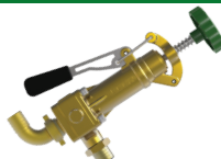
6005.05 Control Unit Regulator