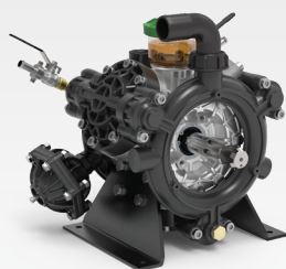
OMEGA 135 TS2C