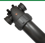
UD1-1/2-16 1-1/2" HI-Flow Filter 16 Mesh Screen