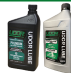
15.5823 Udor Lube Premium Pump Oil