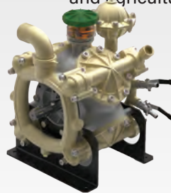
BETA 195 TS2C

BETA-195 pumps are excellent choices for various horticultural and agricultural spraying applications.