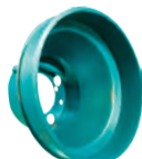
6066.05 PTO Drive Safety Shield