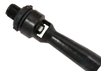
0016.04 Venturi Agitator 1/2" MNPT Inlet