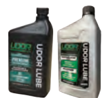
15.5823 Udor Lube Premium Pump Oil