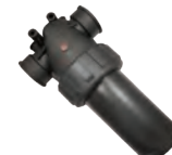
UD1-1/2-16 1-1/2" HI-Flow Filter 16 Mesh Screen