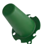
6066.09 Shaft Protector and Mounting Bolts