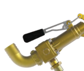
6005.08 Control Unit Regulator