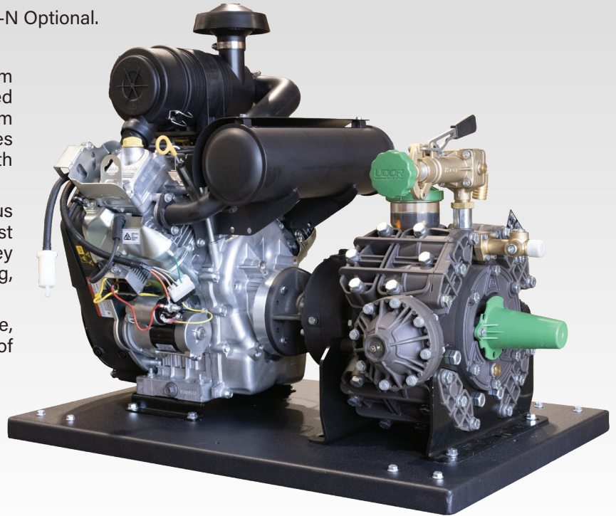
DELTA 170 GR ASSY

The DELTA 170 GR ASSY provides a simple, compact design to allow a wide range of installation options on trucks, trailers or skids.