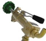
6005.05 Control Unit Regulator