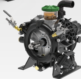
OMEGA 135 TS2C

OMEGA 135 pumps are excellent choices for various horticultural and agricultural spraying applications.