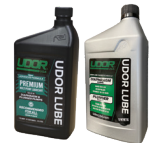
15.5823 Udor Lube Premium Pump Oil