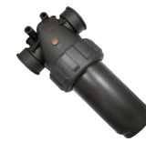
UD1-1/2-16 1-1/2" HI-Flow Filter 16 Mesh Screen