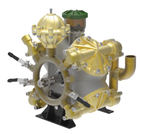
BETA 170 TS2C