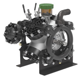
OMEGA 170 TS2C