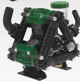
ZETA 70 1C

ZETA 70 pumps are excellent for various horticultural and agricultural spraying applications.