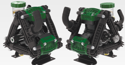
ZETA 70 TS1C