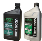
15.5823 Udor Lube Premium Pump Oil