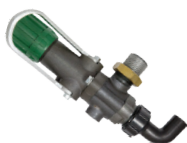
6005.31/LP Control Unit Regulator