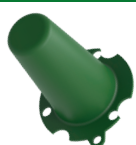
6066.09 Shaft Protector and Mounting Bolts