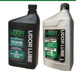
15.5823 Udor Lube Premium Pump Oil