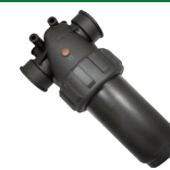
UD1-1/2-16 1-1/2" HI-Flow Filter 16 Mesh Screen