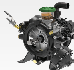
OMEGA 135 TS2C