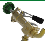
6005.05 Control Unit Regulator