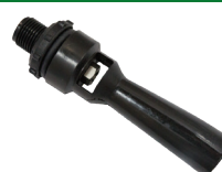
0016.04 Venturi Agitator 1/2" MNPT Inlet