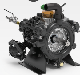
OMEGA 139 TS2C

OMEGA 135 and OMEGA 139 pumps are excellent choices for various horticultural and agricultural spraying applications.