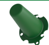
6066.09 Shaft Protector and Mounting Bolts