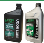
15.5823 Udor Lube Premium Pump Oil