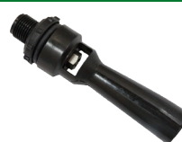
0016.04 Venturi Agitator 1/2" MNPT Inlet