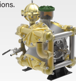
BETA 170 TS2C