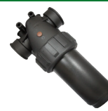
UD1-1/2-16 1-1/2" HI-Flow Filter 16 Mesh Screen