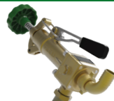
6005.05 Control Unit Regulator