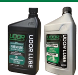
15.5823 Udor Lube Premium Pump Oil