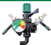
6010.95 Control Unit Regulator w/Gauge