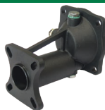
5085.F7 Gear Reduction 3/4" Shaft Gas Engine