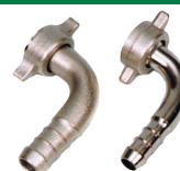
163.604.4 163.604.6 3/8" & 1/2" HB Elbow