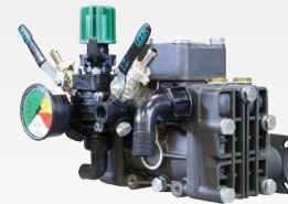
KAPPA 25 GR3/4