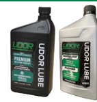
15.5823 Udor Lube Premium Pump Oil