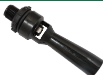
0016.04 Venturi Agitator 1/2" MNPT Inlet