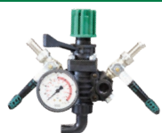
6010.93 Control Unit Regulator w/Gauge