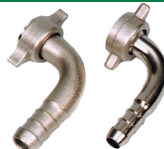
163.604.4 163.604.6 3/8" & 1/2" HB Elbow