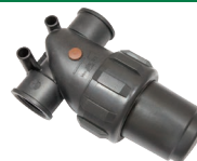
UD1-16 1" HI-Flow Filter 16 Mesh Screen