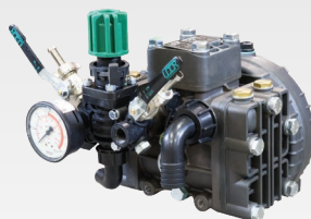
KAPPA 32 GR3/4