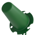
1219.15 Shaft Protector and Mounting Bolts