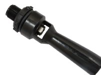
5020.02 Venturi Agitator 1/2" MNPT Inlet