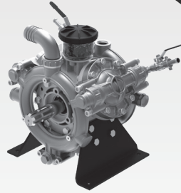
BETA-S 135 TS2C